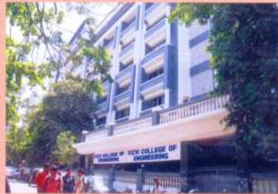
Rizvi College of Engineering, Mumbai