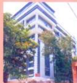
Rizvi Springfield Mumbai