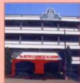
Dr. Rizvi Learners Academy School, Jaunpur