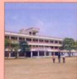
Dr. A.H. Rizvi Degree College Karari