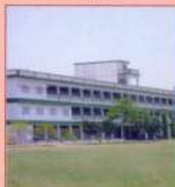
Dr. Rizvi College of Law Karari