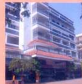
Rizvi College of Arts, Science & Commerce, Mumbai